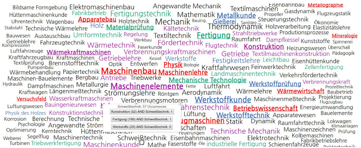
Figure 2: The real humanities scholar project focused on the development of an interactive tag cloud that supports composing engineering branches based on the study subjects of engineering professors. More information can be found in a related publication on the project (Meinecke and Jänicke, 2018).